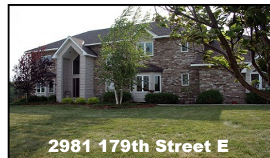
2981 179th Street E

Home on 2.5 Acres close to town - new Kitchen w/cherry cabinets ~ $419,000