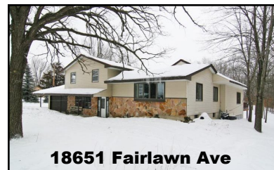
18651 Fairlawn Ave

Home on 12.5 Acres w/two additional shops - 1 heated w/ water ~ $349,900